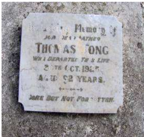
Headstone, Queanbeyan Riverside Cemetery

Transcribed from notes prepared by Iris Carnall.